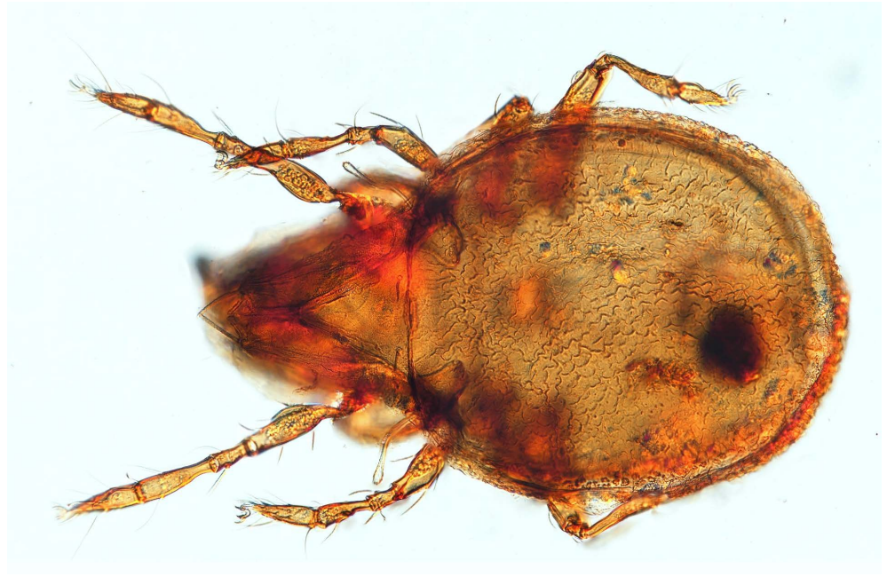
Figure 1 Dorsal view on Xenillus salamoni .

mounting medium. Pictures were taken with a Nikon DS-Ri2 microscope camera and obtained with the aid of Nikon NIS-Elements D software (Nikon Corporation) and rendered with the Helicon Focus 7 program (Kozub et al. 2008).